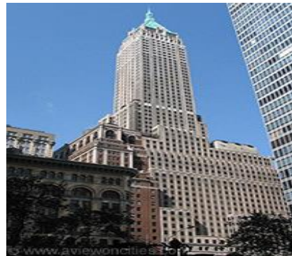
40 Wall Street

Website: http://nyc-architecture.com/TEN/TEN-Monuments.htm