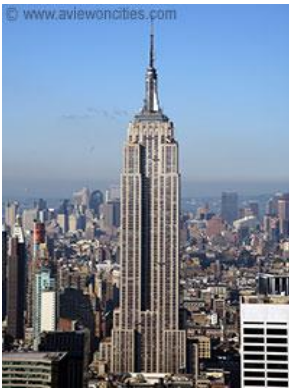
The Empire State Building

a. Write the names of 3 famous buildings of New York City: